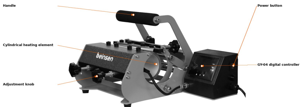
Fig. 1 · Main components of the Beinsen Alina.